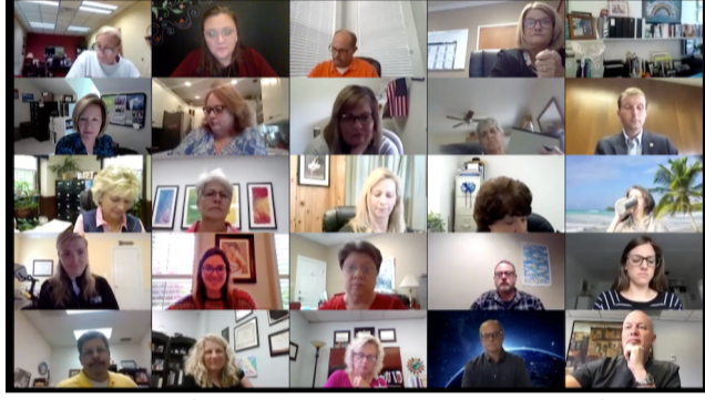
Pictured Above: Community partners at the virtual WWC meeting on April 23rd, 2020