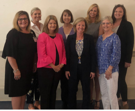
Pictured Above: WWC Planning Committee

The Wilson Wellness Collaborative marked our first anniversary since community partners from all sectors gathered in May of 2019. The Wellness Collaborative developed a 3 year plan to support the health and wellness for all those who work, live, and play in Wilson. Over the past year, over 60 community partners have convened quarterly to discuss the ongoing work, our progress towards the identified goals, and new partnership and collaboration opportunities. We are grateful for all of the partnerships that have made the Wilson Wellness Collaborative possible, and we look forward to the year ahead.