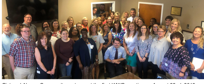
Pictured Above: Community partners at the first WWC meeting on August 22nd, 2019